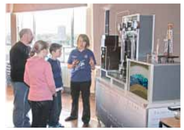
SCI-FUN demonstrating the carbon capture and storage interactive at the Hebridean Science Festival

14. A good example of the latter is the SCI-FUN Roadshow,<sup>5</sup> run by the University of Edinburgh and supported by the Scottish Government, which actively seeks to take the experience of a science centre to early secondary school pupils and public science festivals across Scotland. SCI-FUN currently engages with 10,000 pupils in 50-60 schools across Scotland each year through a unique combination of hands-on exhibits and interactive presentations. It aims to encourage more young people to consider STEM-based career and to appreciate the role of science in their everyday lives. Thanks to their position within the University of Edinburgh they have direct access to the most contemporary research, which allows great support for the topical science strand of CfE.